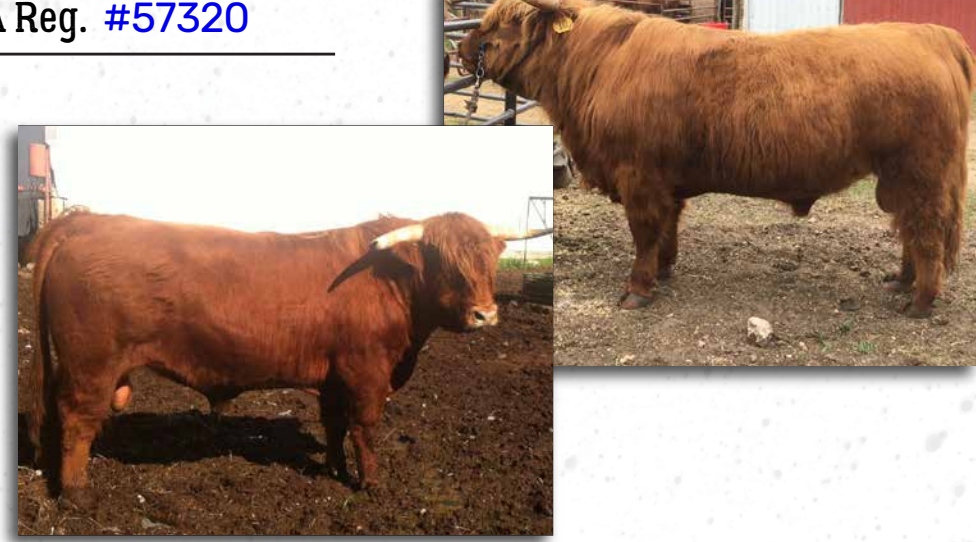
Levi's Sire, Argyll's Jaco (D)

Levi brings performance and maternal genetics to the table. Both his Granddam and Great-Granddam produced 15 calves. Levi has five Impact Sires and one Impact Dam in his immediate background. Sire of Lots 5, 7, 8 -10, 13, 15 and 23.